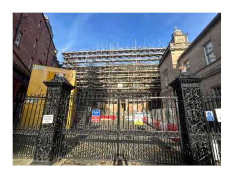
8.5 New Register House External Roof Works (Stage 1)

New Register House, one of our 3 historical buildings within the Edinburgh World Heritage site, requires work in order to protect and preserve the building which houses some of our documents. Following a competitive tender procedure during the year we awarded a contract for external scaffolding to be erected at New Register House which is required for the removing of the old roof and installation of the new one. The scaffolding is in place ready for the successful roofing contractor to begin the works (stage 2) once the outcome of the current competitive tender exercise for the roof works is known.