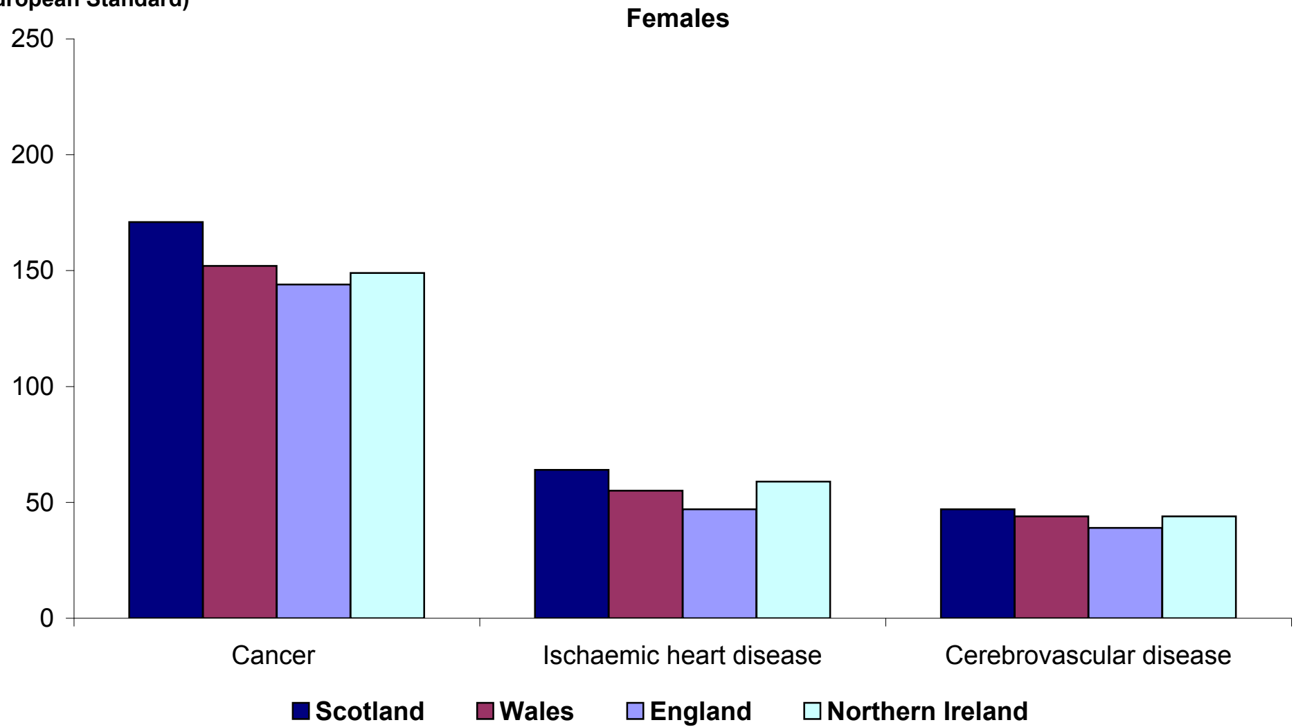
Figure 3.3: Age-adjusted mortality rates, by selected cause and sex, 2010

Rate per 100,000 population (using European Standard)