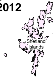
Figure 5.6: Net migration as percentage of population by Council area, Mid-2011 to Mid-2012