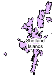
Figure 5.7: Net migration with areas outside Scotland as percentage of population by Council area, Mid-2011 to Mid-2012