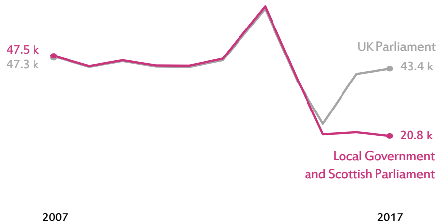
Number of attainers

Attainers are persons who will become old enough to vote in the coming year. Attainers for UK Parliament elections will turn 18 before December 2018, and attainers for Local Government and Scottish Parliament elections will turn 16 before December 2018. Since the voting age was lowered in Scotland, there have been more attainers for UK Parliament elections than for Local Government and Scottish Parliament elections.