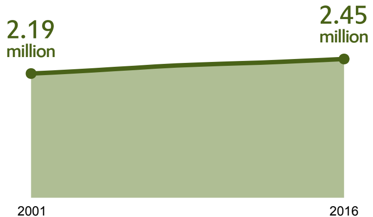
Number of households

A household is defined as one person living alone or a group of people (not necessarily related) living at the same address